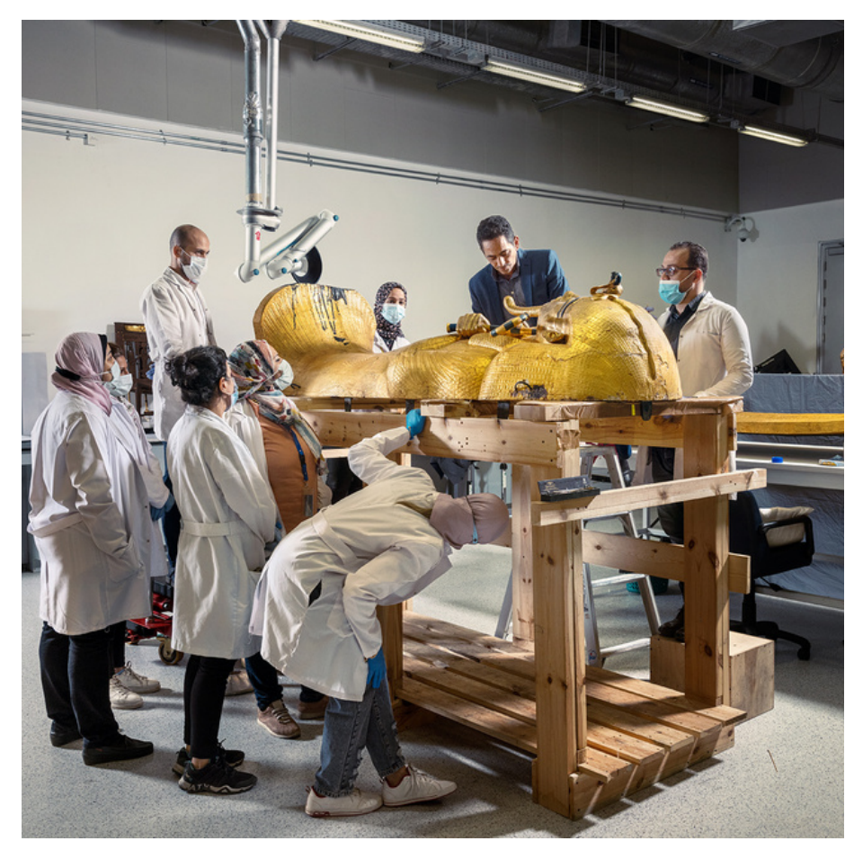
GIZA, CAIRO, EGYPT. WOOD LAB, CONSERVATION CENTER AT THE GRAND EGYPTIAN MUSEUM (GEM) EGYPT, JUNE 2021