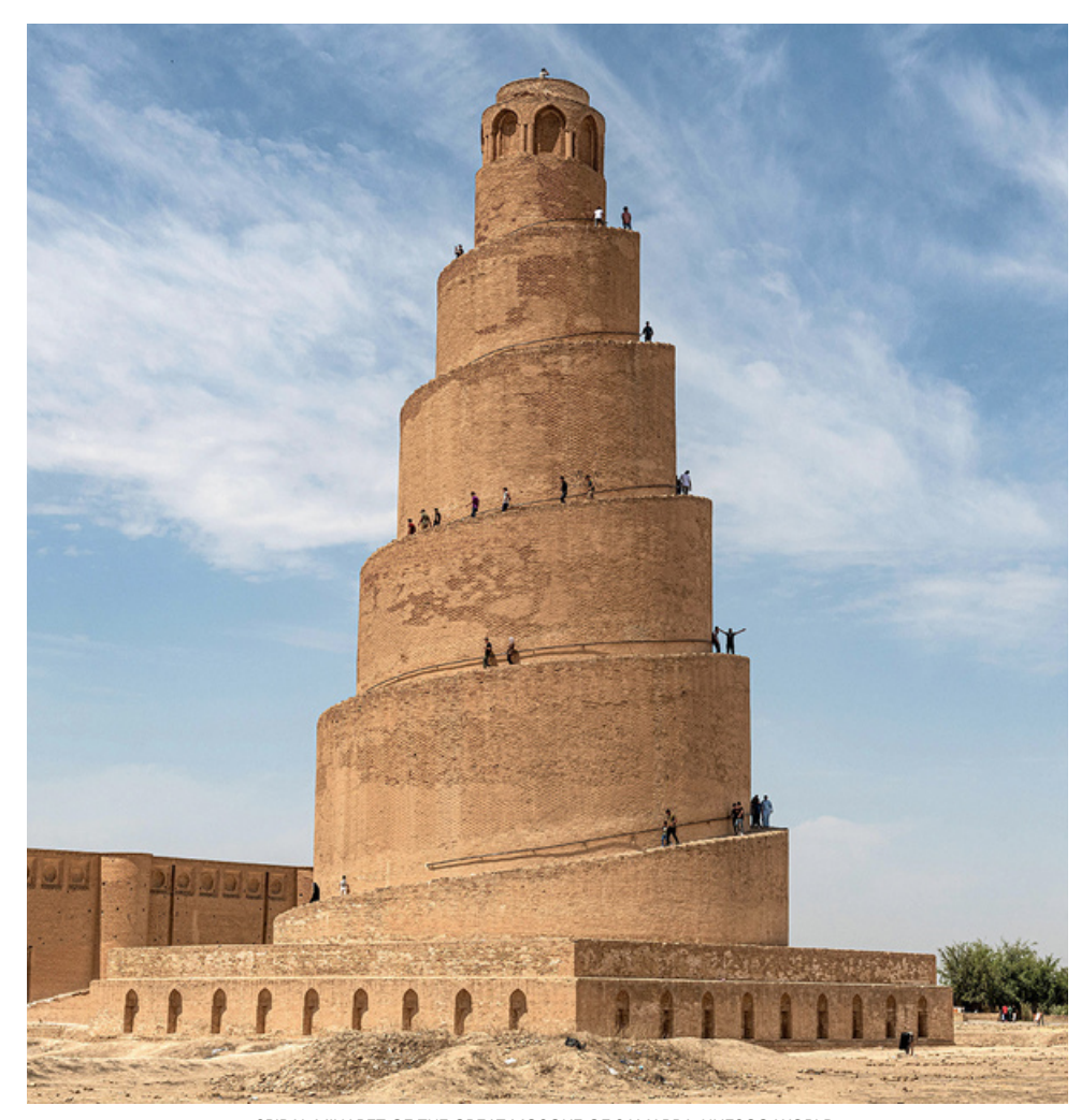
SPIRAL MINARET OF THE GREAT MOSQUE OF SAMARRA, UNESCO WORLD HERITAGE SITE, SAMARRA, IRAQ, MIDDLE EAST © ALAMY STOCK, IMAGE ID: 2G8GOEH: