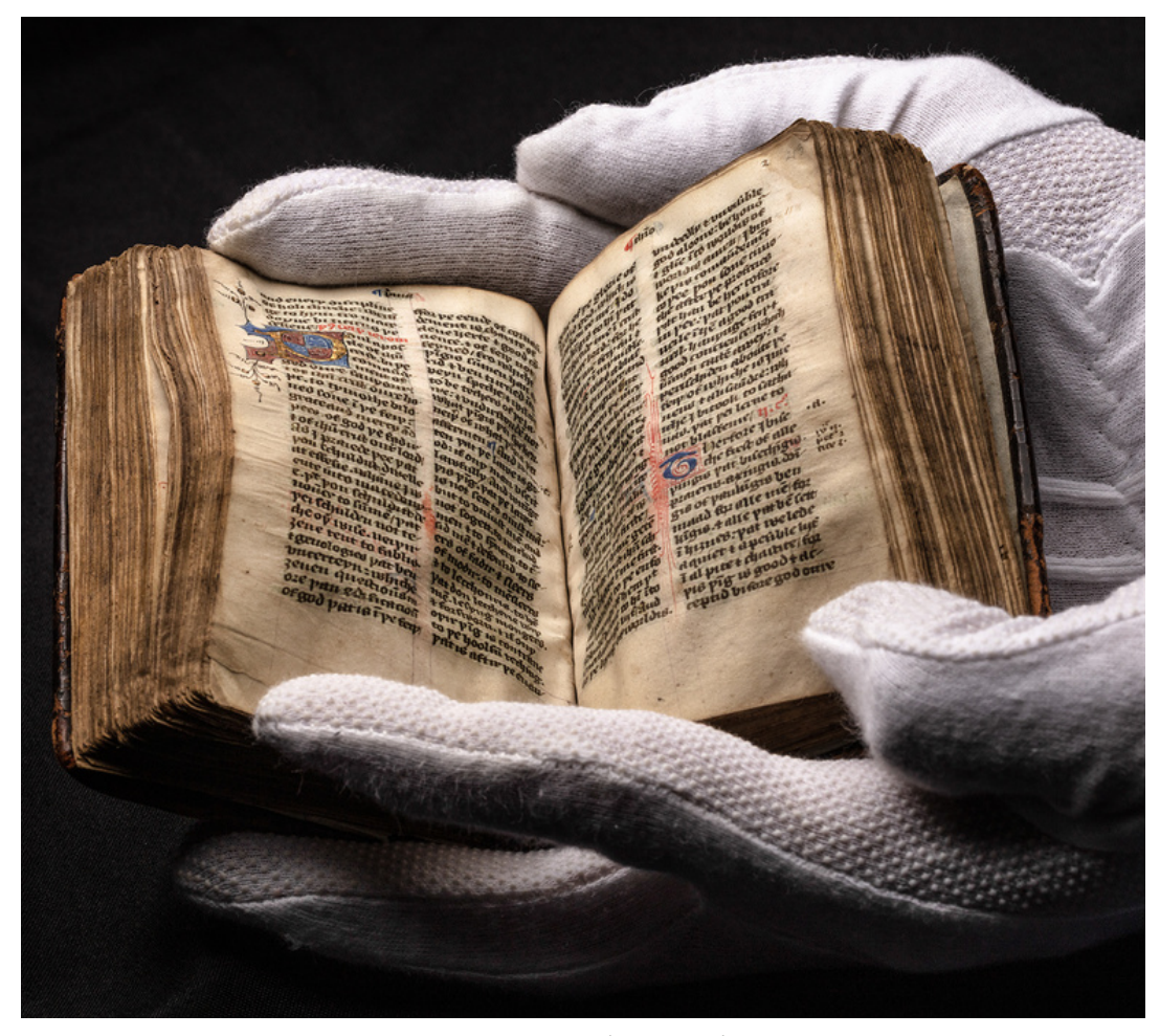
HOLY BIBLE, (AROUND 1400) FROM VAN KAMPEN COLLECTION ON DISPLAY AT THE "HOLY LAND LAND EXPERIENCE" THEME PARK, ORLANDO FLORIDA, 2018